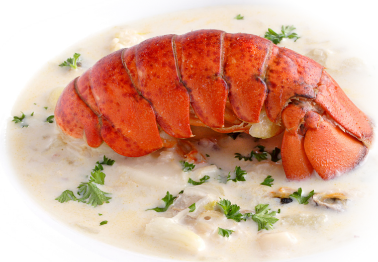
CAPTAIN RANDALL SCOTT Shelburne, Nova Scotia

Clearwater's Raw Frozen Shell-on Lobster Tails are produced using our highest quality, Live Premium Hardshell Fresh™ Lobster, offering a convenient way to enhance your menu. Easy to thaw and prepare, these mouthwatering lobster tails are the perfect accompaniment to any dish with easy preparation and delicious results.