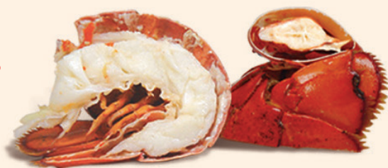
Regular Lobster (contains up to 50% less meat)