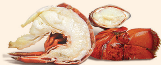
Clearwater Premium Hardshell Fresh™ Lobster

By harvesting Clearwater Premium Hardshell Fresh™ Lobster at ideal times, the superb quality is immediately evident in the hardshell crammed with full-meat and flavor.